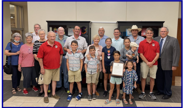
Several Roma Lodge members attended the city council meeting along with Hanford Lodge members.